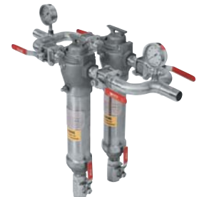
Single and duo filters