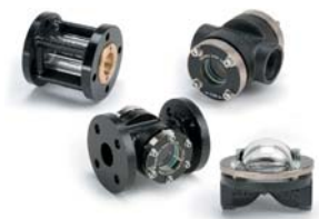
Sight flow indicators