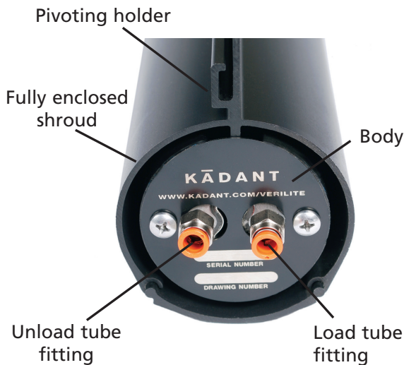
VeriLite X roll cleaner assembly shown is enclosed and used for harsh environments.

The patent pending VeriLite roll cleaner assembly provides a compact and unique scraper that offers excellent cleaning results to improve uptime and reduce maintenance costs in a variety of industrial roll and belt cleaning applications.