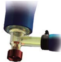
CLP 350 sight glass providing high visibility

Our decades of experience using Kadant Noss hydrocycloning systems has led to our replacement concepts for OEM parts. The Kadant solution features CLP complete single unit hydrocyclones and hydrocyclones parts that are designed with fewer components, offer easy re-assembly, and can be used in existing banks or canisters.