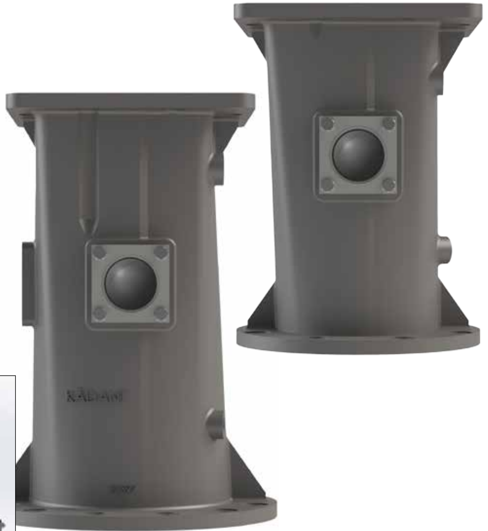
STR 8-10 Reject Chamber with STR Valves

Wear-resistant containment of high concentration heavy debris during stock cleaning applications